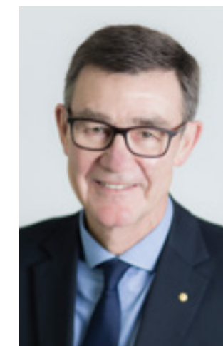
Service Patron Air Chief Marshal Sir Angus Houston AK AFC (Retd)