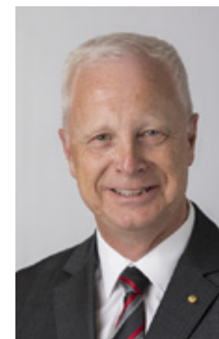
Service Patron Air Chief Marshal Mark Binskin AC (Retd)