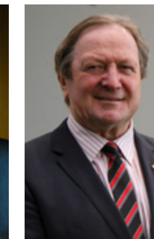
Ambassador Kevin Sheedy AM