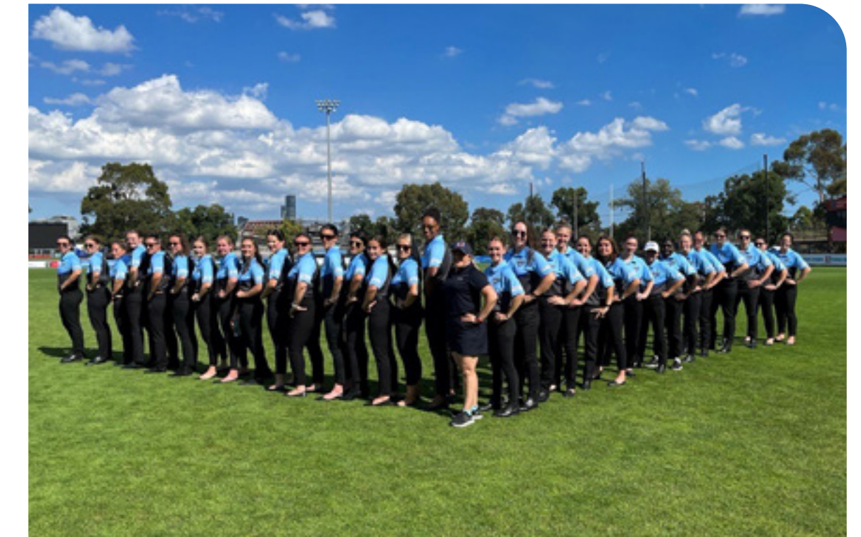
>>> Thank you to the Royal Australian Air Force for supporting Bravery Trust as a charity partner at the Australian Defence Force Aussie Rules (ADFAR) National Carnival.