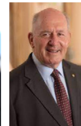
Ambassador Sir Peter Cosgrove AK MC (Retd)