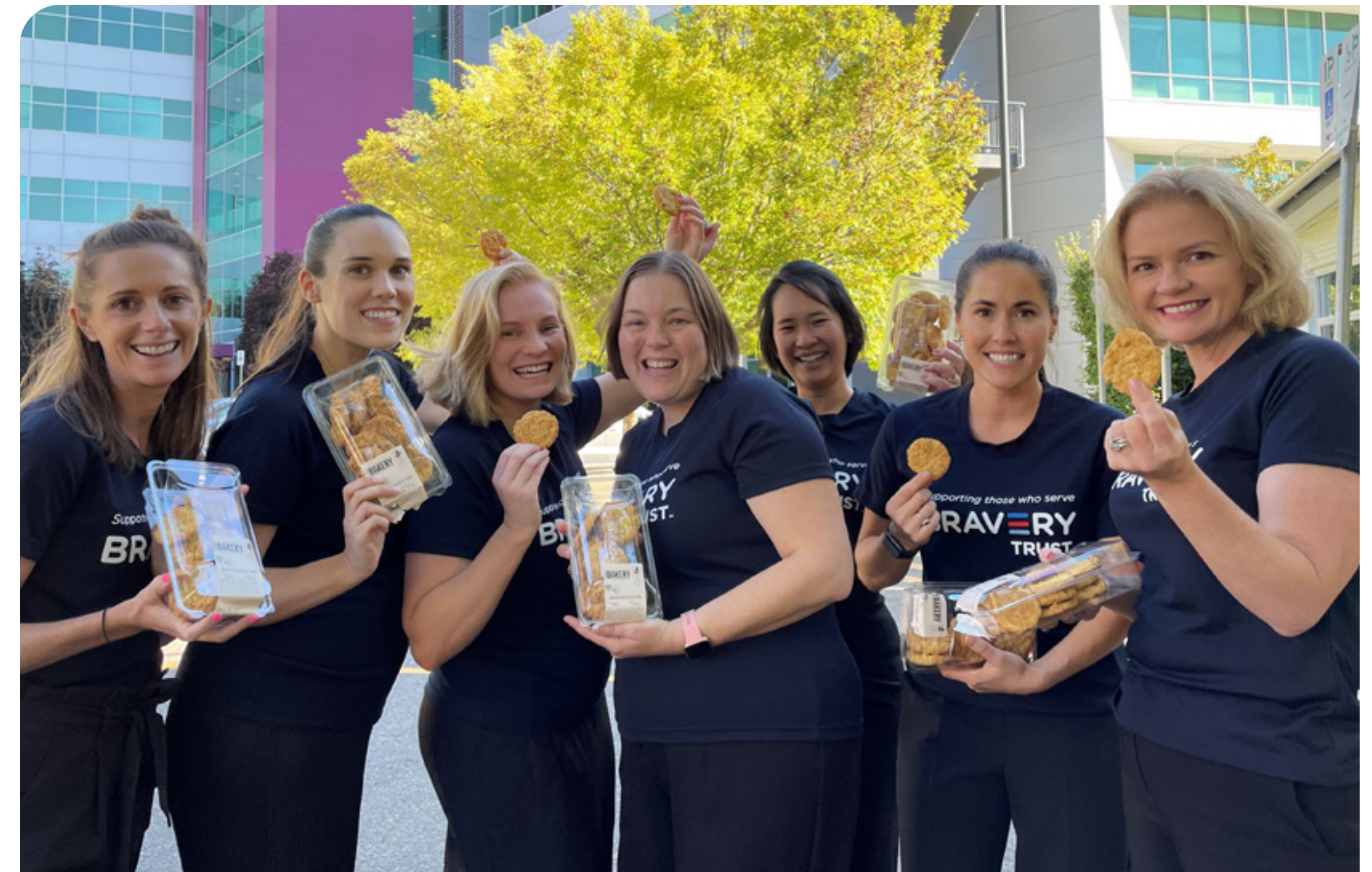
>>> Collaboration is one of our core values. We will continue to work closely with organisations like Defence Families of Australia (DFA) to have maximum impact for our veteran community.

We look forward to expanding our positive impact over the next 10 years with the support of our existing and new partners, our wonderful community of fundraisers and donors, and the broader Defence and veteran community.