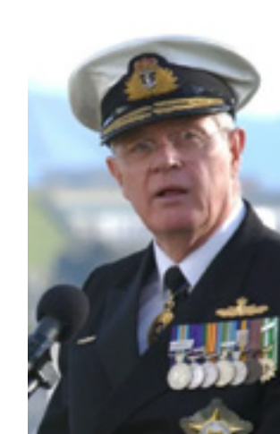
Service Patron Admiral Chris Barrie AC, FAICD, FAIM, FARPI, RAN (Retd)