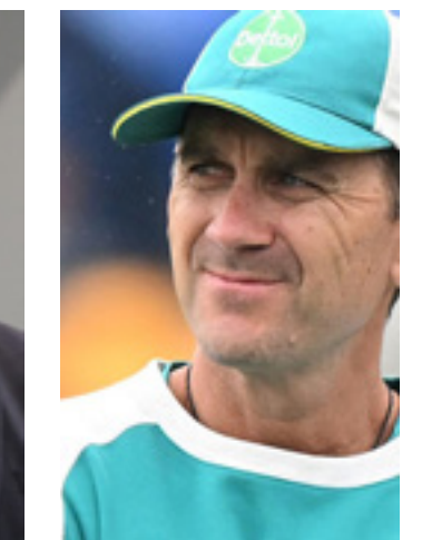
Ambassador Justin Langer AM